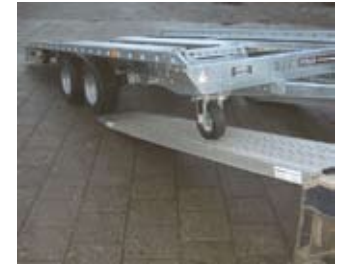
Optional loading wheels deployed for 'piggy back' operation